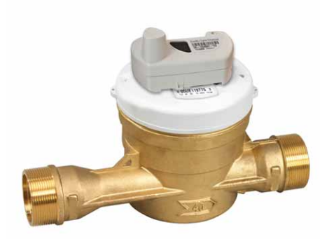
EverBlu Cyble Enhanced fitted on Commercial and Industrial water meter