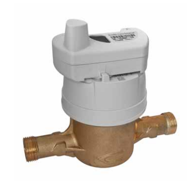
EverBlu Cyble Enhanced fitted on Residential water meter