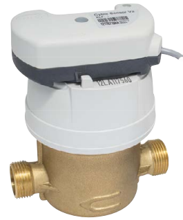
Water meter equipped with cyble sensor module