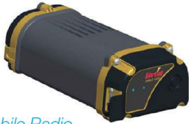
Itron Mobile Radio (actual size: 3.20" W x 5.66" L x 1.53" H)