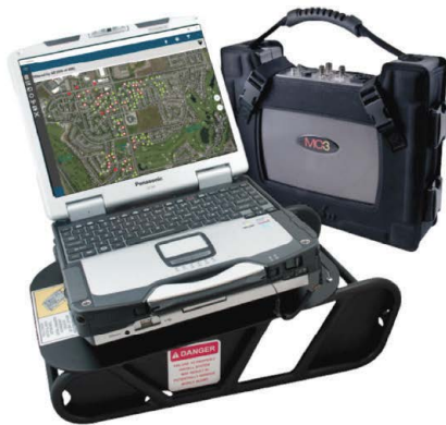
Itron MC3 Radio (actual size: 13" W x 11.25" L x 2.75" H)