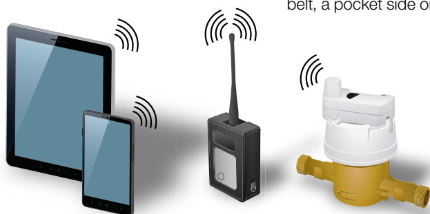
Bluetooth RF Master Architecture

It is auto – alimeted with rechargeable standard batteries- performing up to 2000 radio readings per day with batteries full-charged, large full day autonomy – 8 h permanent BT communication.