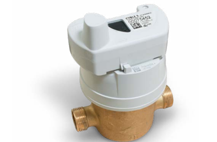
Aquadis+ equipped with the Cyble 5 module