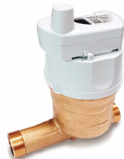
TD8 equipped with the Cyble 5 module