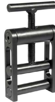
FIG. 1 Pocket Squeeze Off Tool 600 x 600

Oil Type : Hydraulic Jack Mineral (type HL, or HM 30cSt at 400°C)