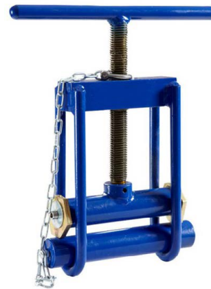
FIG. 2 Squeeze Off Tool with Chain 600 x 600