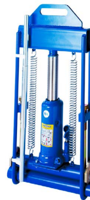
FIG. 3 Squeeze Off Tool Hydraulic 63-180-75-200