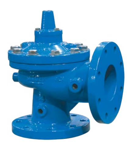
FIG. 1 Alternative models A206-PG Angle