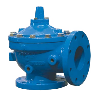
FIG. 1 Alternative model A106-PG Angle