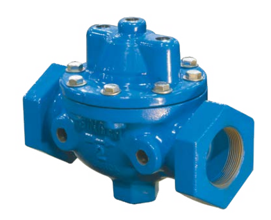
FIG. 2 Alternative model 106-PG THREADED